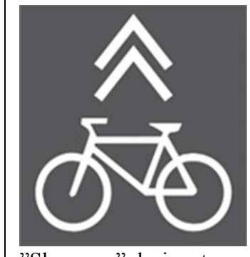
"Sharrows" designate areas where riders can safely share lanes with automobiles

8) Evaluate inexpensive short term improvements such as painting "sharrows" on shared bicycle and traffic lanes that add comfort and increase user-ship without substantial taxpayer expense.