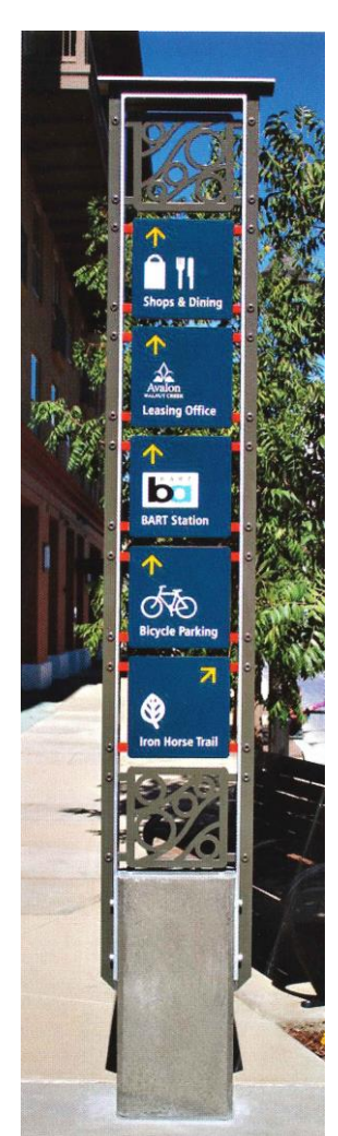
Simple directional signs add comfort to a pedestrian or bicycle experience, thereby encouraging the use of alternate methods of transportation